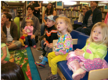
Lunch in the Park