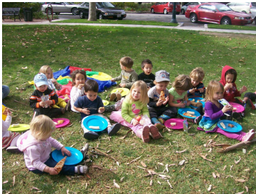
Library Field Trip